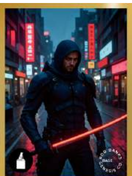
2/4/4 - Gold Edition | Genesis Collection