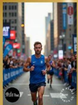
3/4/4 - Gold Edition | Genesis Collection