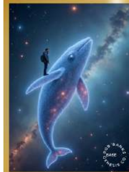
4/4/4 - Gold Edition | Genesis Collection