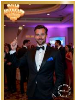
2/4/4 - Gold Edition | Genesis Collection