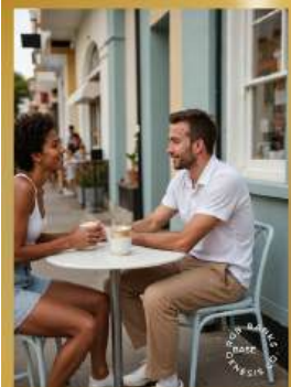
4/4/4 - Gold Edition | Genesis Collection