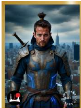
1/4/4 - Gold Edition | Genesis Collection

A portion of the proceeds from all NFT sales goes to support charities and non-profit organizations around the world.